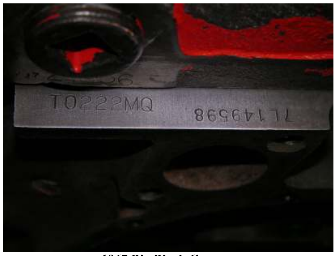
1967 Big Block Camaro