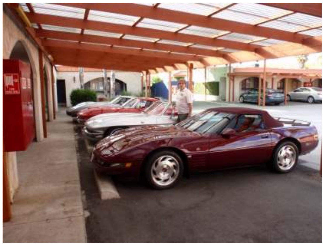
The next morning it was an early start as we continue the drive through to Melbourne. The venue was held at Corvette Clinic in Bundoora.