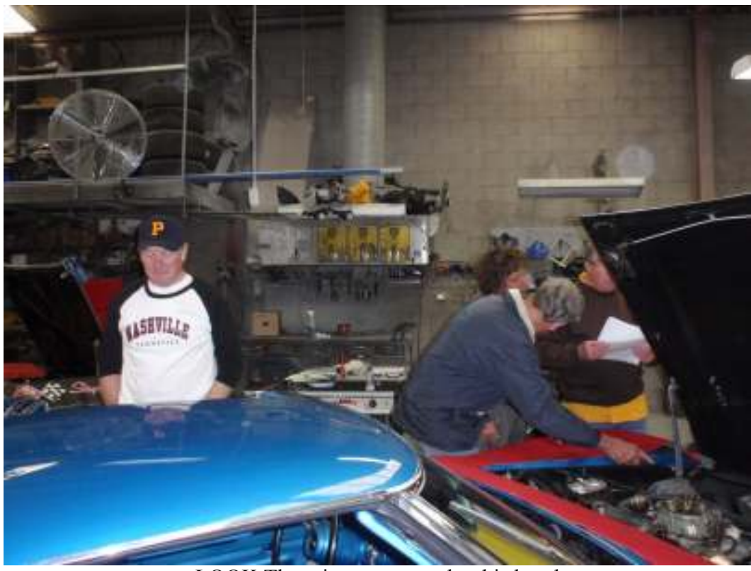
LOOK There is a motor under this hood