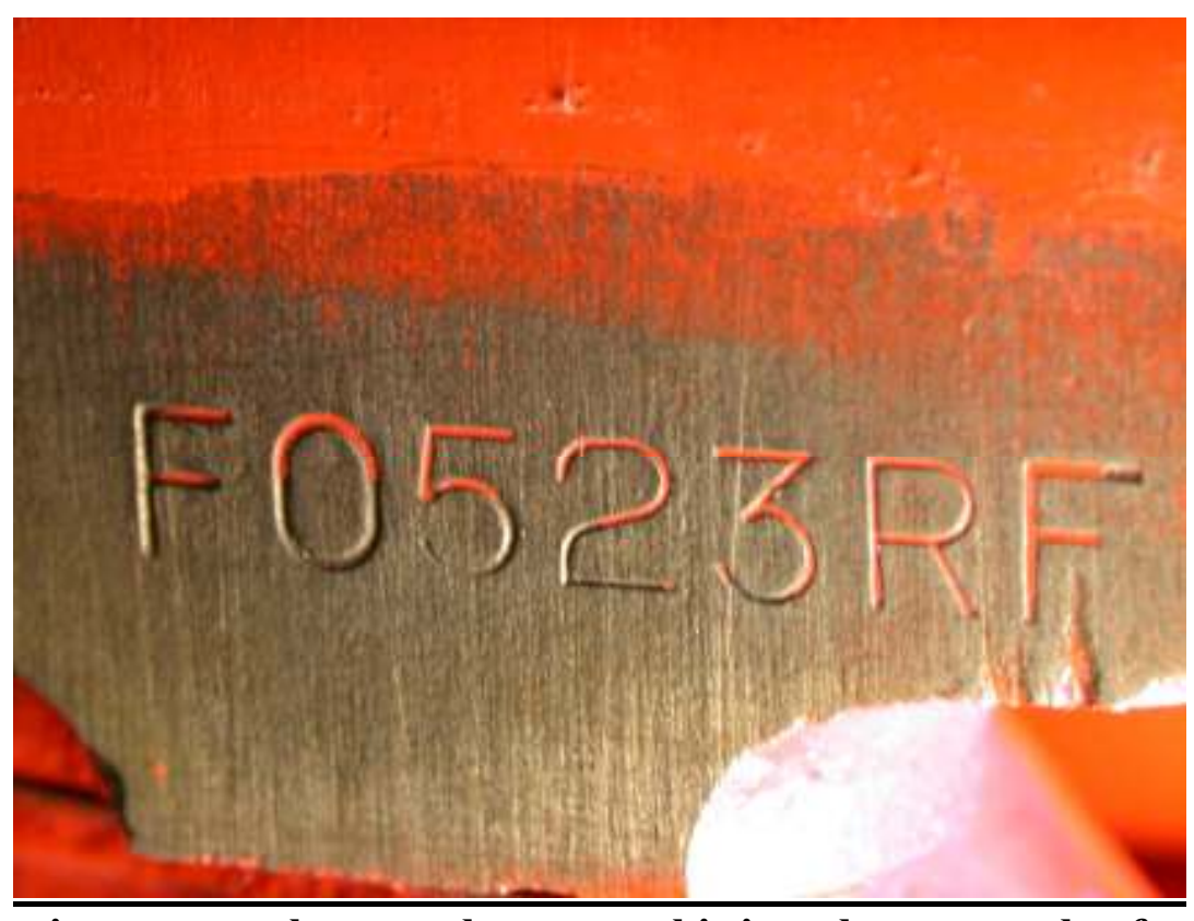
This is an important photo to observe as this is a clear example of a restamp