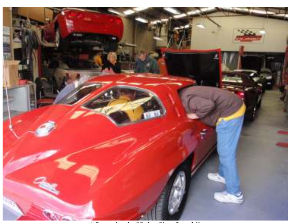
"Somebody Help, I'm Stuck" Murray's 1963 Split Window